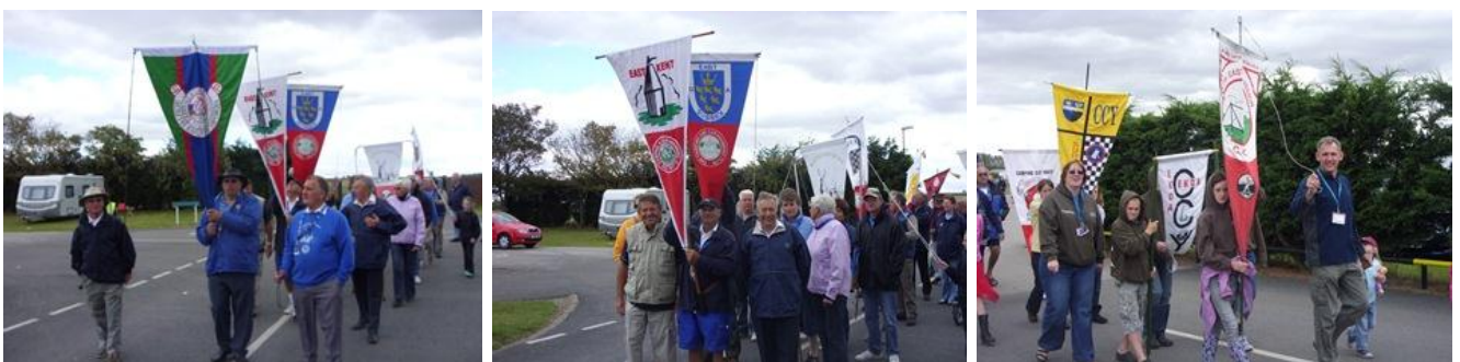
Pennons on Parade at the NFOL - Left to Right - Region Pennon, EKDA Pennon and EKDA CCY Pennon